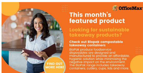
eNewsletter banner example

Banner ads allow for a single image to be inserted in the newsletter that can be hyperlinked to a website, form submission or email address. Several options are available for sizing but spaces are limited per issue.